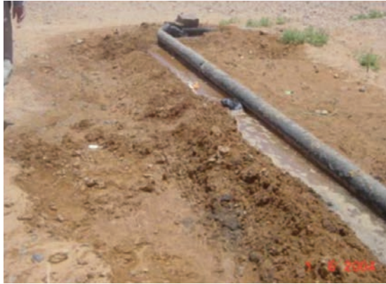
A typical water seepage

already proven by various research projects using satellite imagery. 3 Earth Observation images could therefore be used to search for any signs of spillage (i.e. wet sand colour), as well as to detect plants and other chlorophyllic organisms that are usually present in the area of the leakage. Should a leak anywhere in the waterworks be suspected (although, admittedly, the system would work better outside of the cities and in general areas filled with concrete), a specially trained inspector would be sent to survey the problem on the spot and communicate the results to the responsible authorities. Such communication would involve, among others, geographical coordinates of suspected leak sites for investigation that would be inserted into a database for future reference.